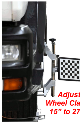
Adjustable Wheel Clamps for 15" to 27" Rims

Also Includes Storage Stands for Wheel Clamps!