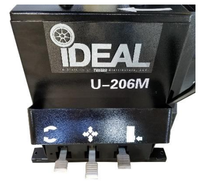
Fully Operational Foot Pedals for Turntable Rotation, Opening / Closing Clamps & Bead Breaker Operation