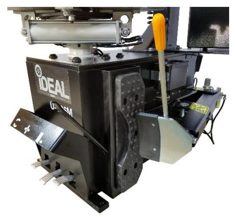
Protective Curved Bead Breaker Pad Designed for Supporting Motorcycle Tires