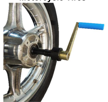
Convenient 'Hand Spin' Balancer Handle