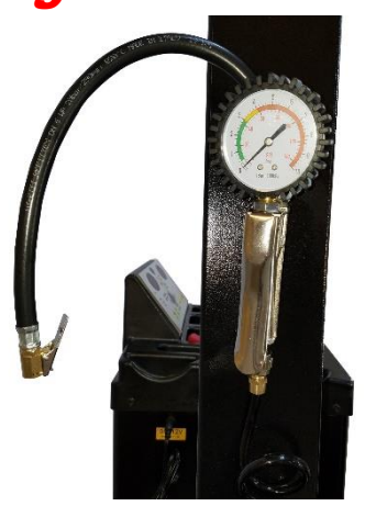
Rapid Tire Inflation & Pressure Gauge