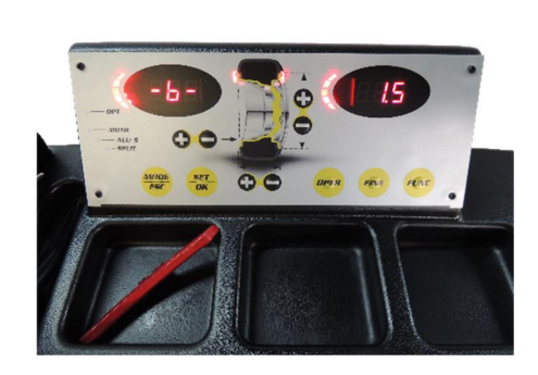
Balancer LED Digital Display & Storage Tray