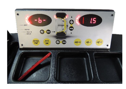
Balancer LED Digital Display & Storage Tray