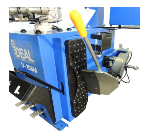
Protective Curved Bead Breaker Pad Designed for Supporting Motorcycle Tires