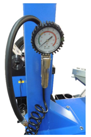
Rapid Tire Inflation & Pressure Gauge