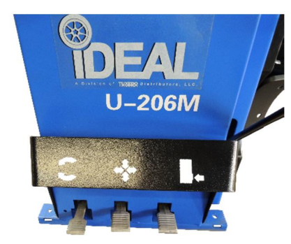
Fully Operational Foot Pedals for Turntable Rotation, Opening / Closing Clamps & Bead Breaker Operation