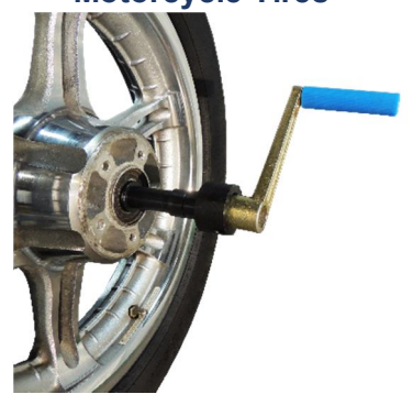
Convenient 'Hand Spin' Balancer Handle